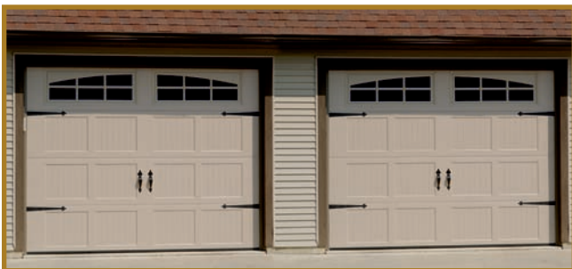
Pictures shown with optional strap hinges. Black hand forged handles are standard.