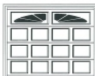
Sunburst 2 Panel