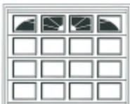
Sunburst 4 Panel

• Trim inserts utilize a "snap-in" design for easy removal to clean glass.